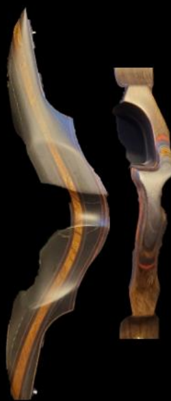
SN9176 Right Hand Phenolic outers, Shedua Inners.