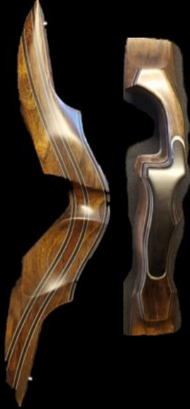
SN8790 Right Hand All Shedua, Phenolic Overlay.