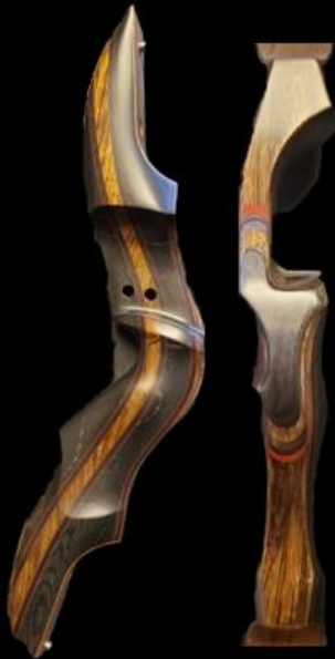
SN9436 Left Hand Phenolic outers, Shedua Inners. Plunger Insert