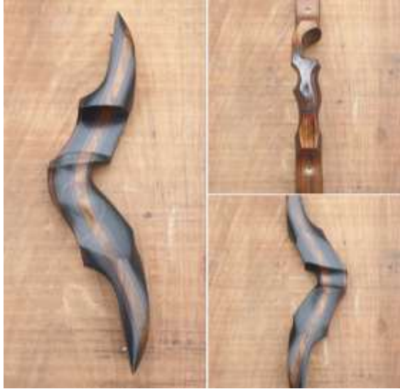
SN6097 17" RH. Phenolic with Shedua Centre. Red Accents. Riser Cut for a Larger Hand