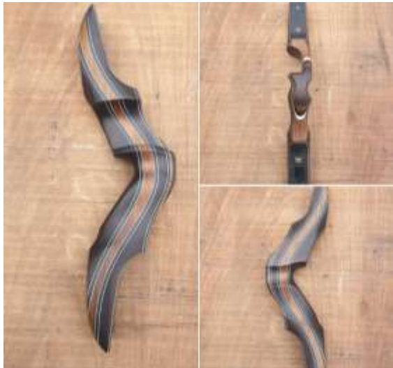
SN1575 17" LH. Indonesian Rosewood with Shedua Centre. White Accents