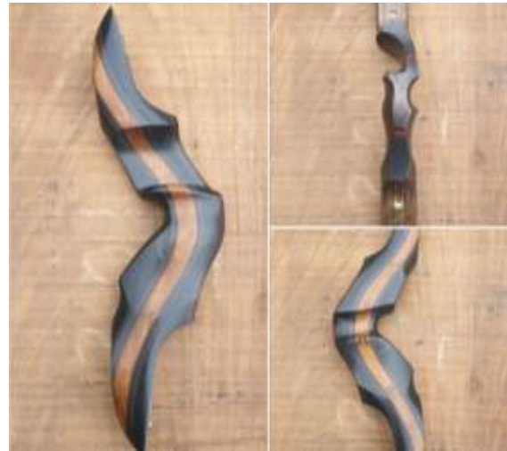
SN5612 17" LH. Phenolic with Shedua Centre. Carbon Overlays. Grip for a Larger Hand.