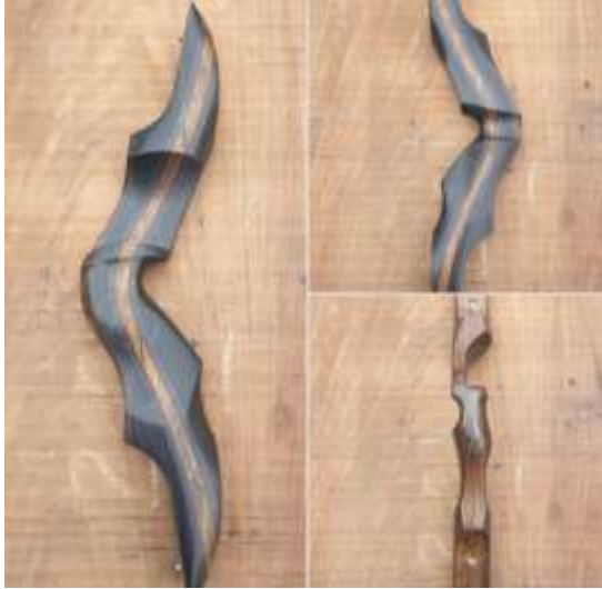
SN5145 19" RH. Phenolic with Shedua Centre. Red Accents