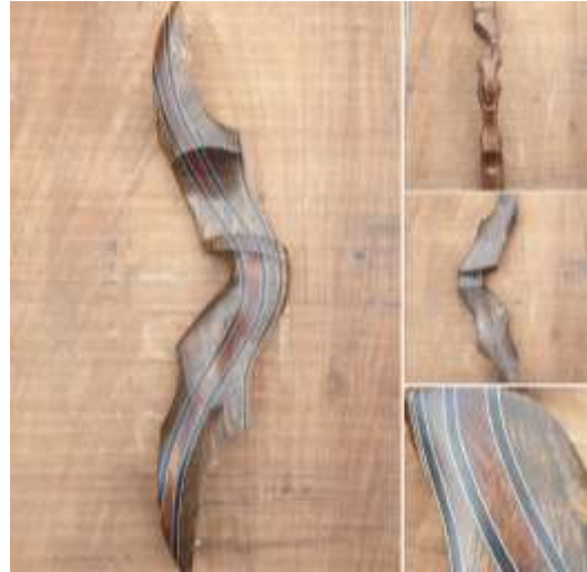
SN7038 19" LH. Shedua with Honduras Walnut Centre. White Accents.