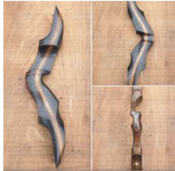
SN5717 19" RH. Phenolic with Shedua Centre. Red Accents