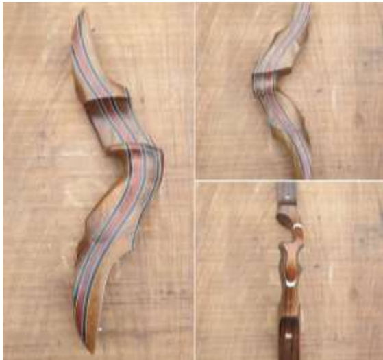
SN1647 17" RH. Shedua with Bubunga Centre. White Accents