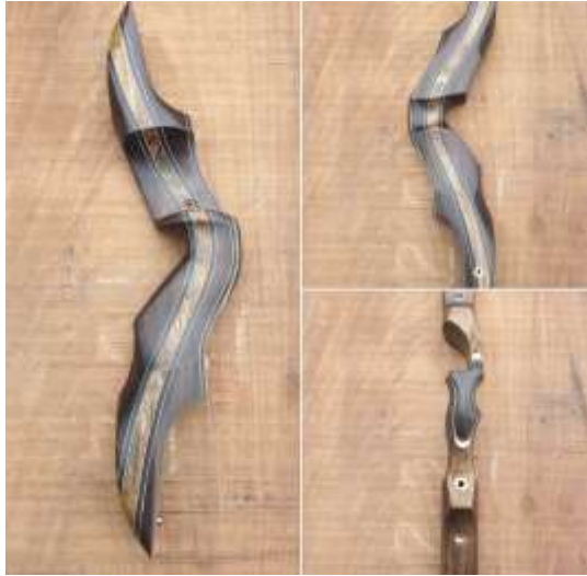
SN7086 19" LH. Indonesian Rosewood with Shedua Centre. White Accents. Light Mass Stabiliser Bush with Strike Plate Countersink. Quiver Inserts and a Horn Overlay.