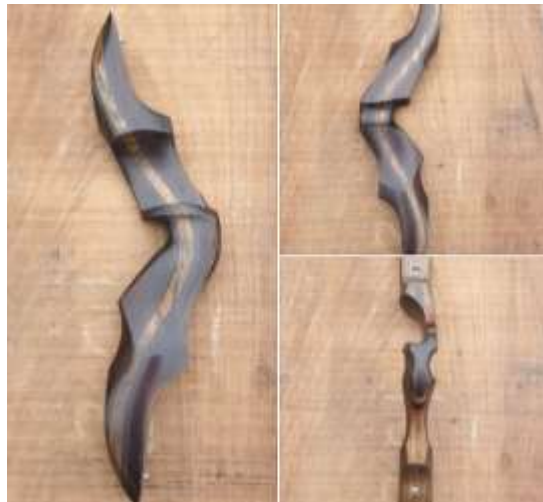
SN5571 19" LH. Indonesian Rosewood with Shedua Centre. Red Accents.