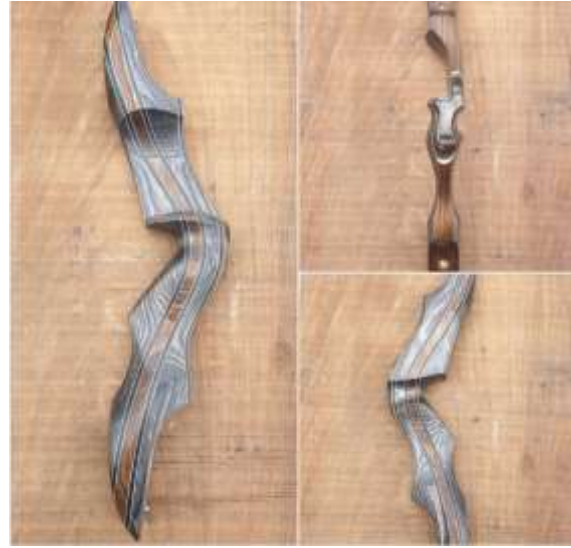
SN1276 21" LH. Heritage Midnight with Heritage Walnut Centre. White Accents