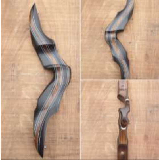
SN1720 17" LH. Indonesian Rosewood with Shedua Centre, White Accents