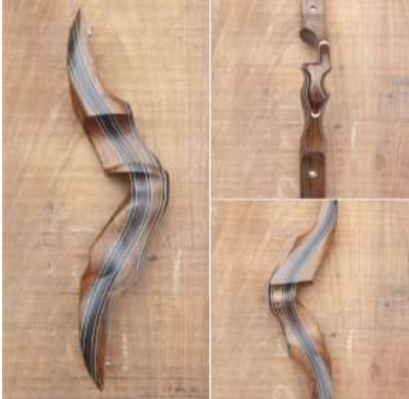
SN1272 17" RH. Shedua Outers with Indonesian Rosewood Centre, White Accents