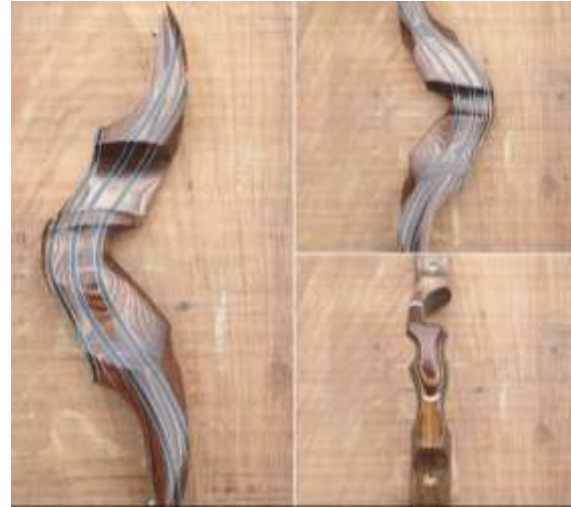
SN7046 17" RH. All Heritage Walnut with White Accents.