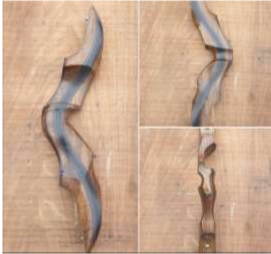
SN5631 19" RH. Shedua with Phenolic Centre. Red Accents