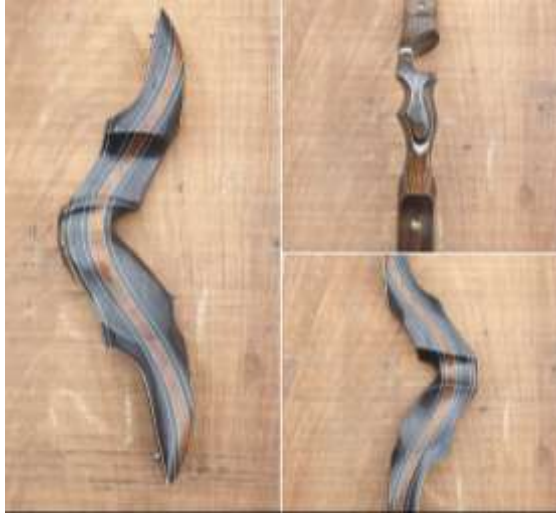
SN3365 17" RH. Heritage Midnight with Shedua Centre. White Accents