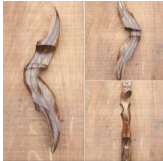
SN7043 17" RH. Shedua with Becote Centre. Red Accents.