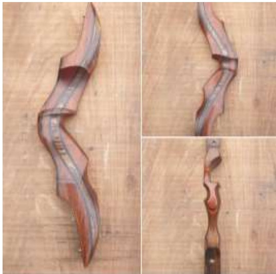
SN5986 19" RH. Burmese Paduk with Heritage Walnut Centre. Red Accents.