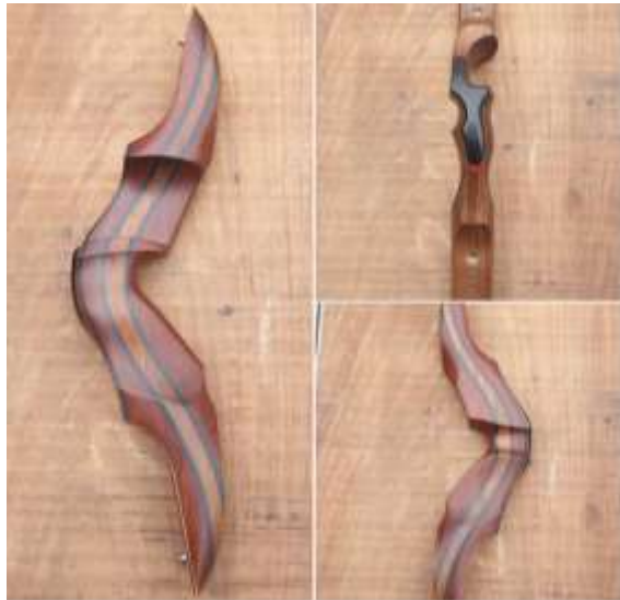
SN3410 17" RH. Mystery Wood with Shedua Centre. Red Accents and Buffalo Horn Overlay