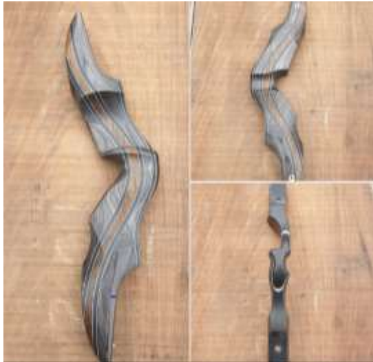
SN4666 19" LH. Heritage Midnight with Shedua Centre. White Accents. Carbon & Buffalo Horn Overlay and Quiver Inserts.