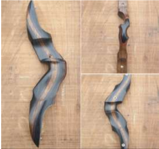
SN4545 17" LH. Phenolic with Shedua Centre. Plunger Bush with Strike Plate Recess. Quiver Inserts and Buffalo Horn Overlay