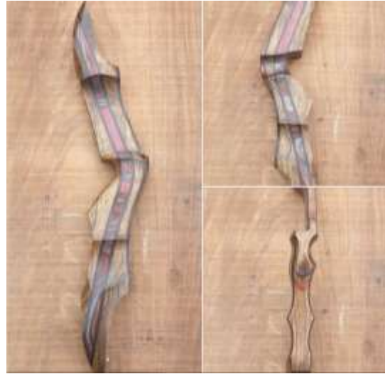
SN5677 23" LH. Shedua Outers and Heritage Jacaranda Centre. Red Accents.