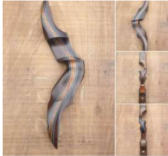
SN1270 17" LH. Wenge Outers with Shedua Centre. White Accents