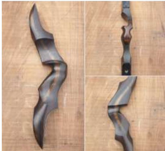
SN1172 19" LH. Wenge with Shedua Centre. Carbon Overlay and Black Accents.