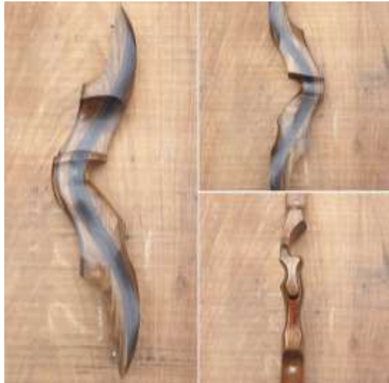
SN7041 19" RH. Shedua with Heritage Midnight Centre. Red Accents.