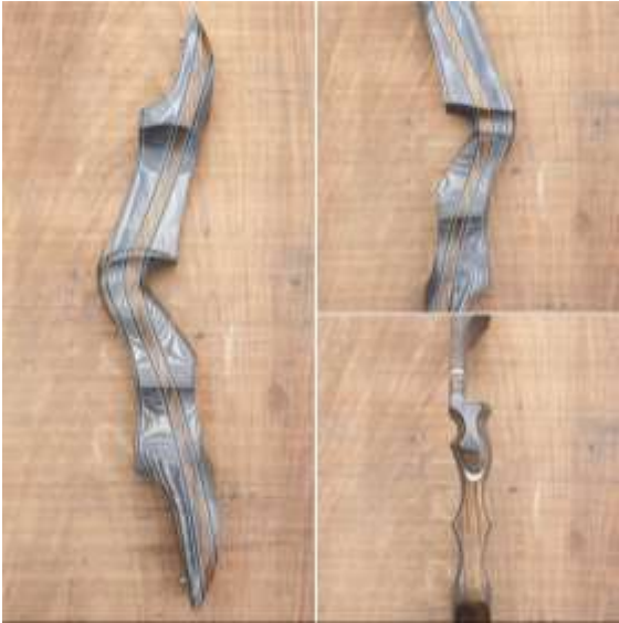
SN1060 23" RH Heritage Midnight with Shedua Centre, White Accents