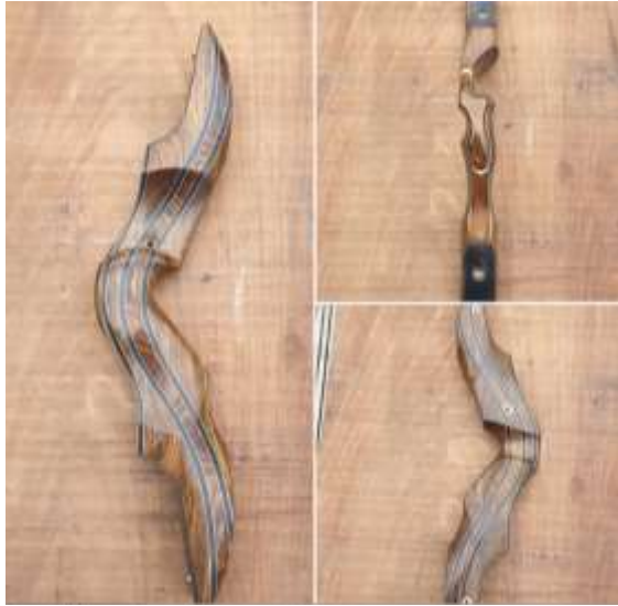
SN7099 19" RH. Shedua Outer with Becote Centre. White Accents. Quiver Inserts and Plunger Bush with Countersink for Strike Plate.